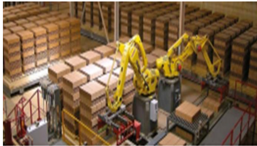
Industry 4.0 (Manufacturing)