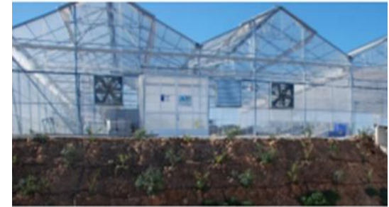
Farming and Agriculture