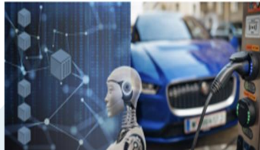
Mobility and Automotive